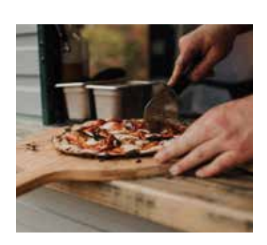
9 PM Party the night away with your guests and enjoy a choice of evening food.