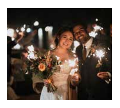
Midnight Your music comes to an end – time to retreat to your Honeymoon Suite.