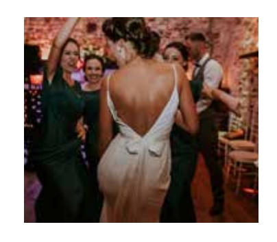
7:30 PM Your moment as a newlywed couple to cut the cake and have your first dance.