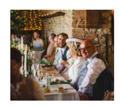
4:30 PM Your wedding breakfast is served – we recommend allowing two hours for this part of the day.