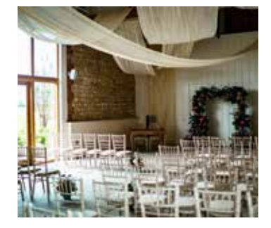
2 PM It's time for your ceremony in your choice of location.