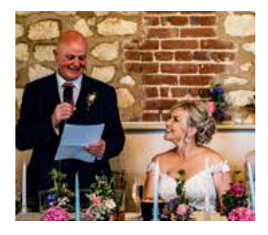
6:30 PM Time for the allimportant speeches.