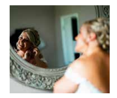
10 AM You and your wedding party begin getting ready in the Preparation Room.